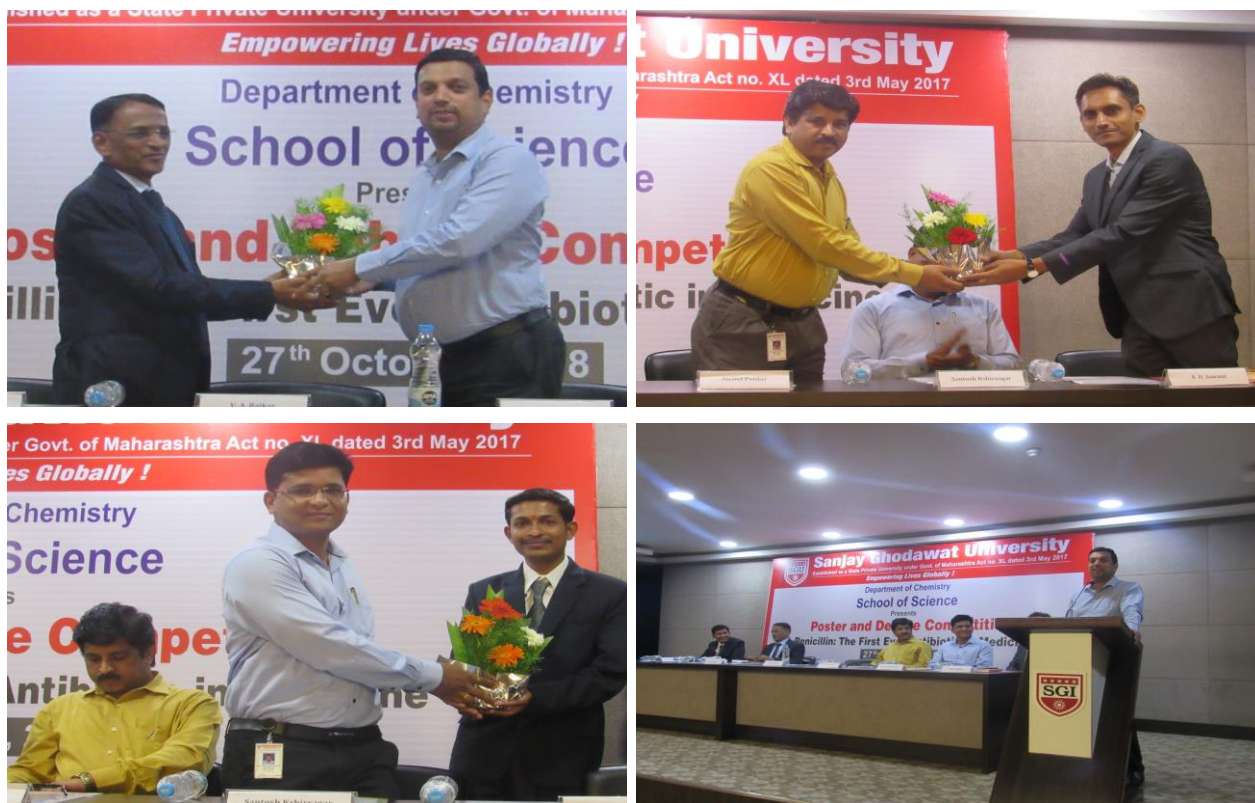
Felicitation of guests