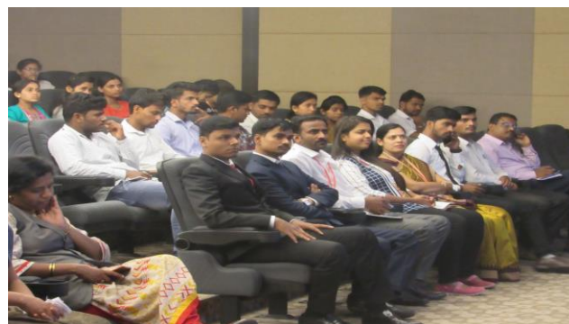
Debate competition snaps