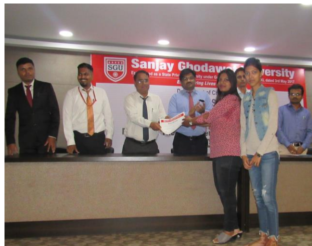
Prize distribution snaps