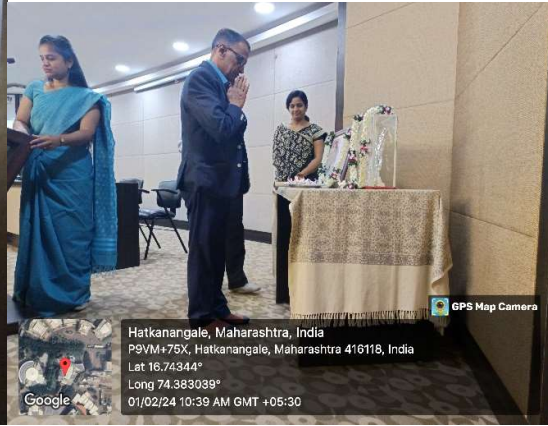
Hatkanangale, Maharashtra, India P9VM+75X, Hatkanangale, Maharashtra 416118, India Lat 16.74344° Long 74.383039° 01/02/24 10:39 AM GMT +05:30