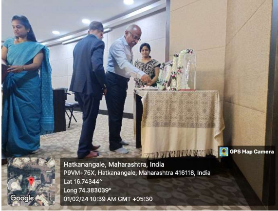
Hatkanangale, Maharashtra, India P9VM+75X, Hatkanangale, Maharashtra 416118, India Lat 16.74344° Long 74.383039° 01/02/24 10:39 AM GMT +05:30