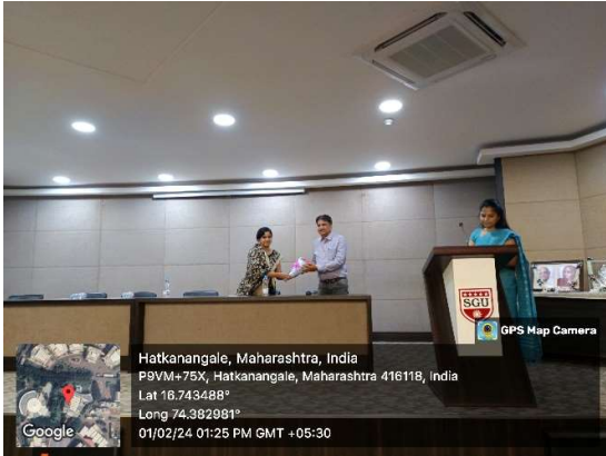
Hatkanangale, Maharashtra, India P9VM+75X, Hatkanangale, Maharashtra 416118, India Lat 16.743488° Long 74.382981° 01/02/24 01:25 PM GMT +05:30