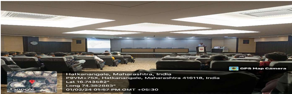
Hatkanangale, Maharashtra, India P9VM+75X, Hatkanangale, Maharashtra 416118, India Lat 16.743582° Long 74.382883° 01/02/24 01:57 PM GMT +05:30

Kolhapur, MH, India Hatkanangale, Kolhapur, 416118, MH, India Lat 16.743560, Long 74.384315 02/02/2024 04:47 PM GMT +05:30 Note : Captured by GPS Map Camera