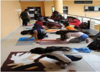
Fig. 27. Rangoli