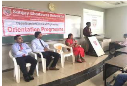
Fig 1. Inaugural Function

We organized Orientation Programme for Second Year Electrical Engineering SGU students on 8 th July 2019, Monday. It includes Inaugural function, curriculum explanation, Labs visit of the department and Industrial visit.