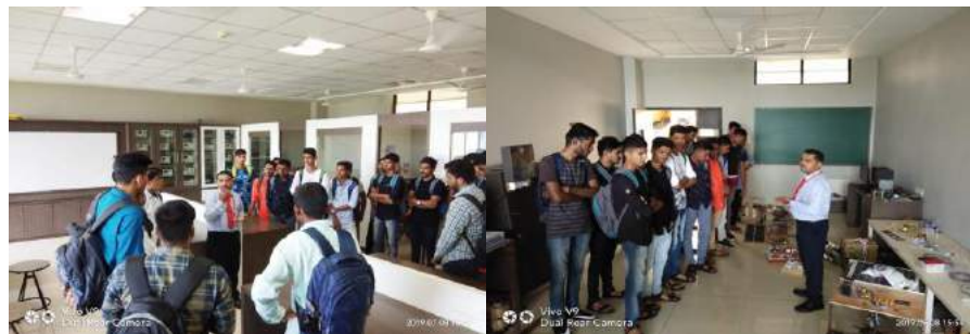
Fig 3. Lab Visits