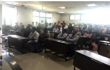
Fig 2. Curriculum Explanation