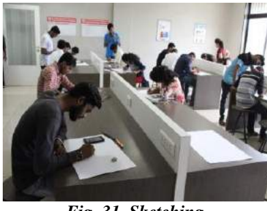
Fig. 31. Sketching