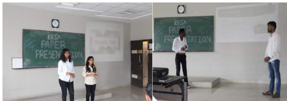
Fig. 38. Paper Presentation