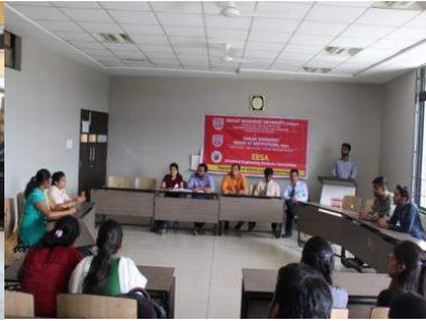
Fig. 28. Debate