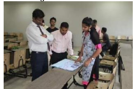
Fig. 32. Poster Presentation