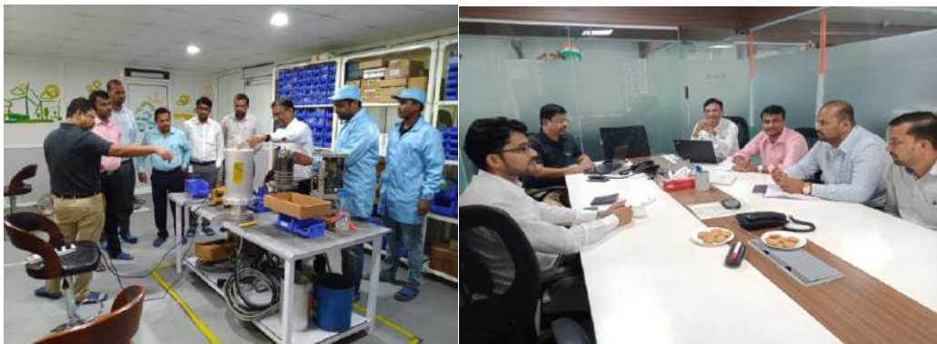
Fig 24. Discussion and Visit at RENOM

We the faculties of Electrical Engineering department are in the discussion and contact with RENOM Energy Service Limited at Pune in order to start the research activities in Wind Energy conversion system.