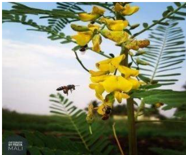
Fig. 30 Photography