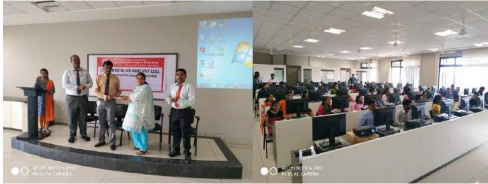
Fig 7. Workshop on MATLAB under VAT