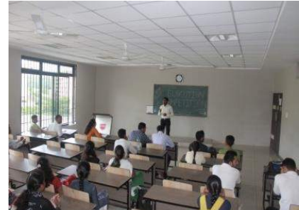
Fig. 29. Elocution