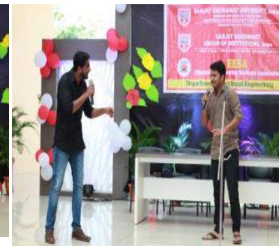
Fig. 35 Standup comedy