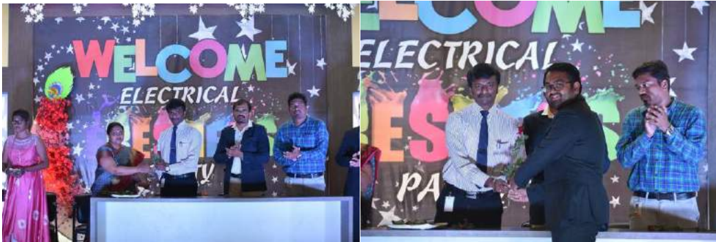
Fig. 38. Fresher's Welcome Ceremony