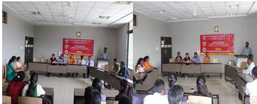
Fig. 37 Group Discussion