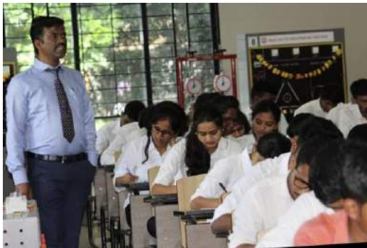
Fig 5. Solar Ambassadors Workshop