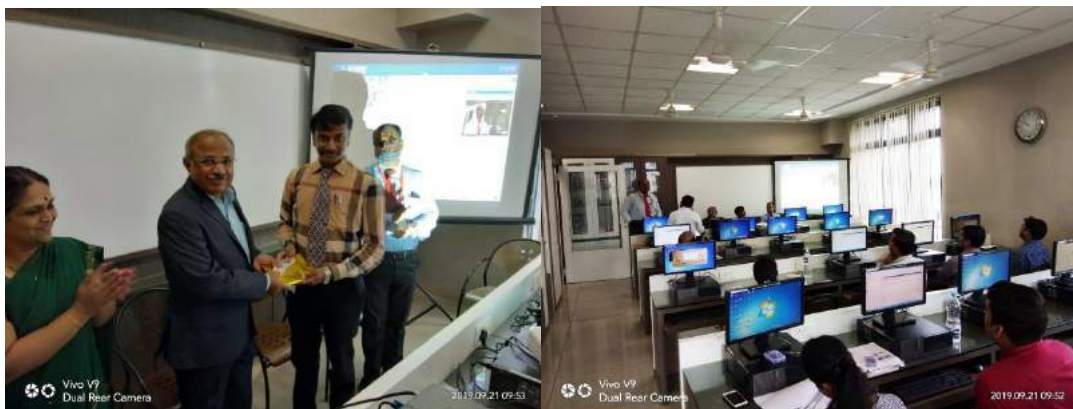
Fig 10.eEsim Workshop Inauguration and Training