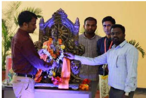
Fig 25. Inaugural Function of DTH

As a part of cultural activities, our department has organized ‘ Departmental Talent Hunt ’ (DTH) on 14 th & 15 th September 2019 . This event was conducted to motivate the hidden talents of Electrical Engineering students.