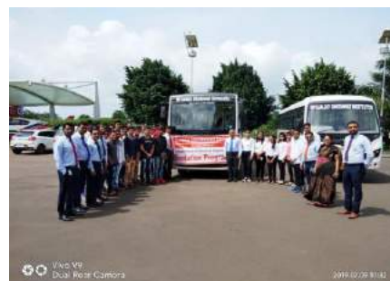
Fig 4. Industrial Visit