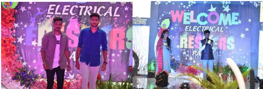
Fig. 39. Students Participation in fresher's day