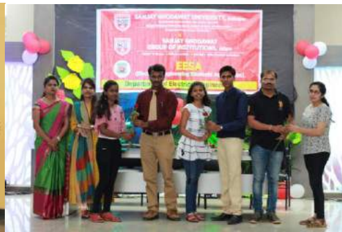
Fig 26. Prize Distribution