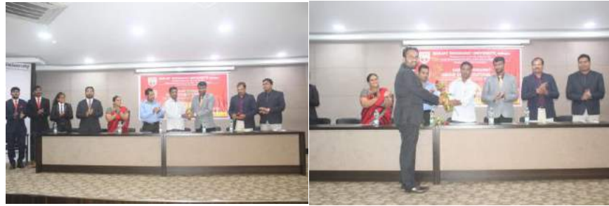
Fig. 36 Inauguration of EESA and Motivational Lecture