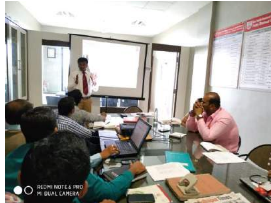
Fig 9. Discussion on Finding Research Problem