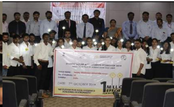
Fig 6. Group of Solar Ambassadors