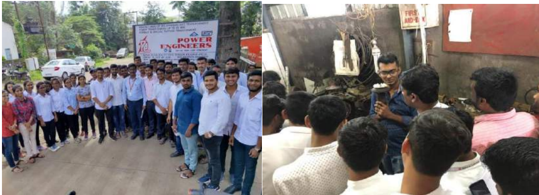
Fig 10. Industrial Visit of Third year SGU students