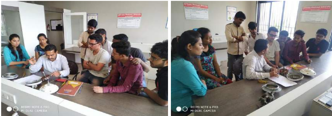
Fig 7. Workshop on Maintenance of Home Appliances