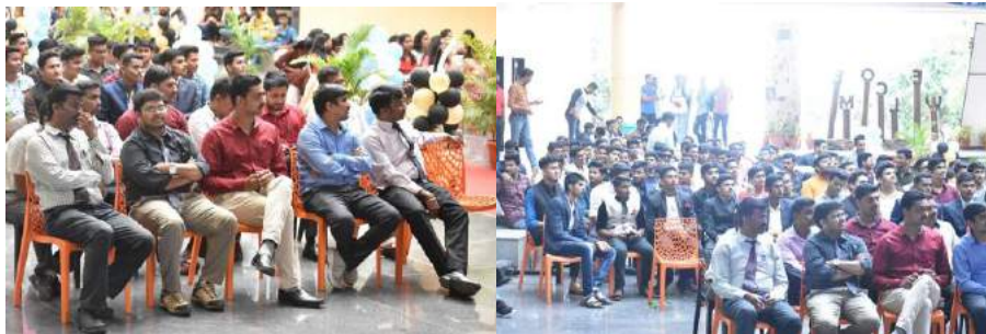
Fig. 40. Students and staff are enjoying the event