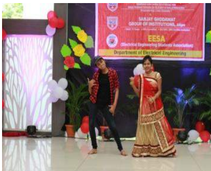
Fig. 34. Dance