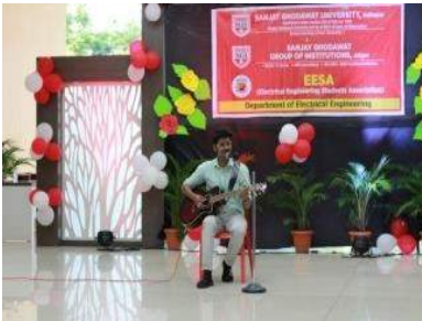
Fig. 33 Singing