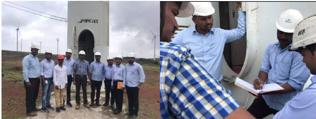
Fig 12. Faculties Industrial Visit at RENOM