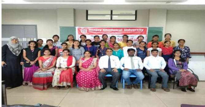
12 th February 2020: Jaysingpur College, Jaysingpur