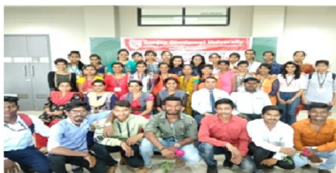
8 th February 2020: KWC College Sangli.