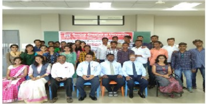
18 th February 2020: PVP College, KavateMahankal.