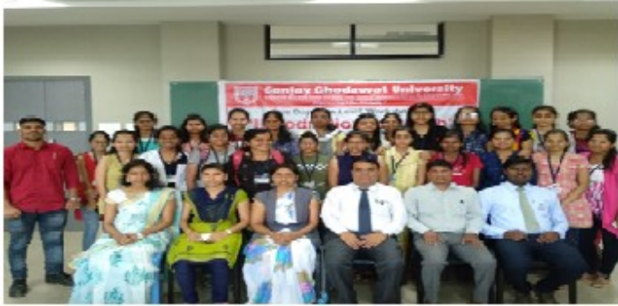
15 th February 2020: New College, Kolhapur.