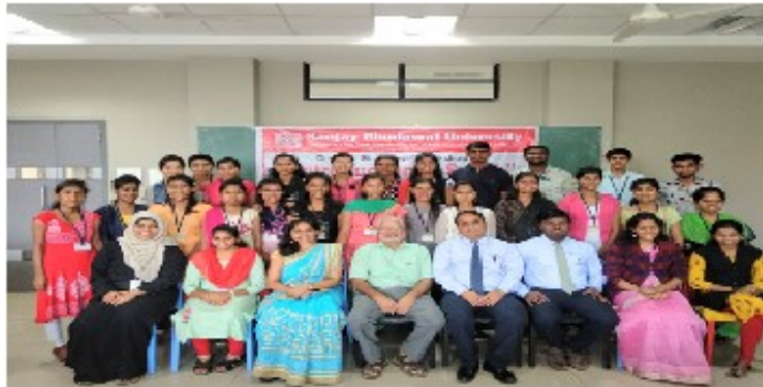
13 th February 2020: D.R. Mane College Kagal.